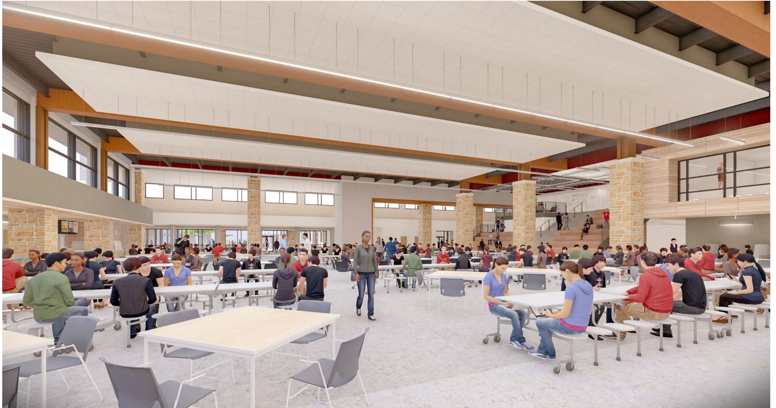
COMMONS AREA - LOOKING TOWARDS MAIN STREET