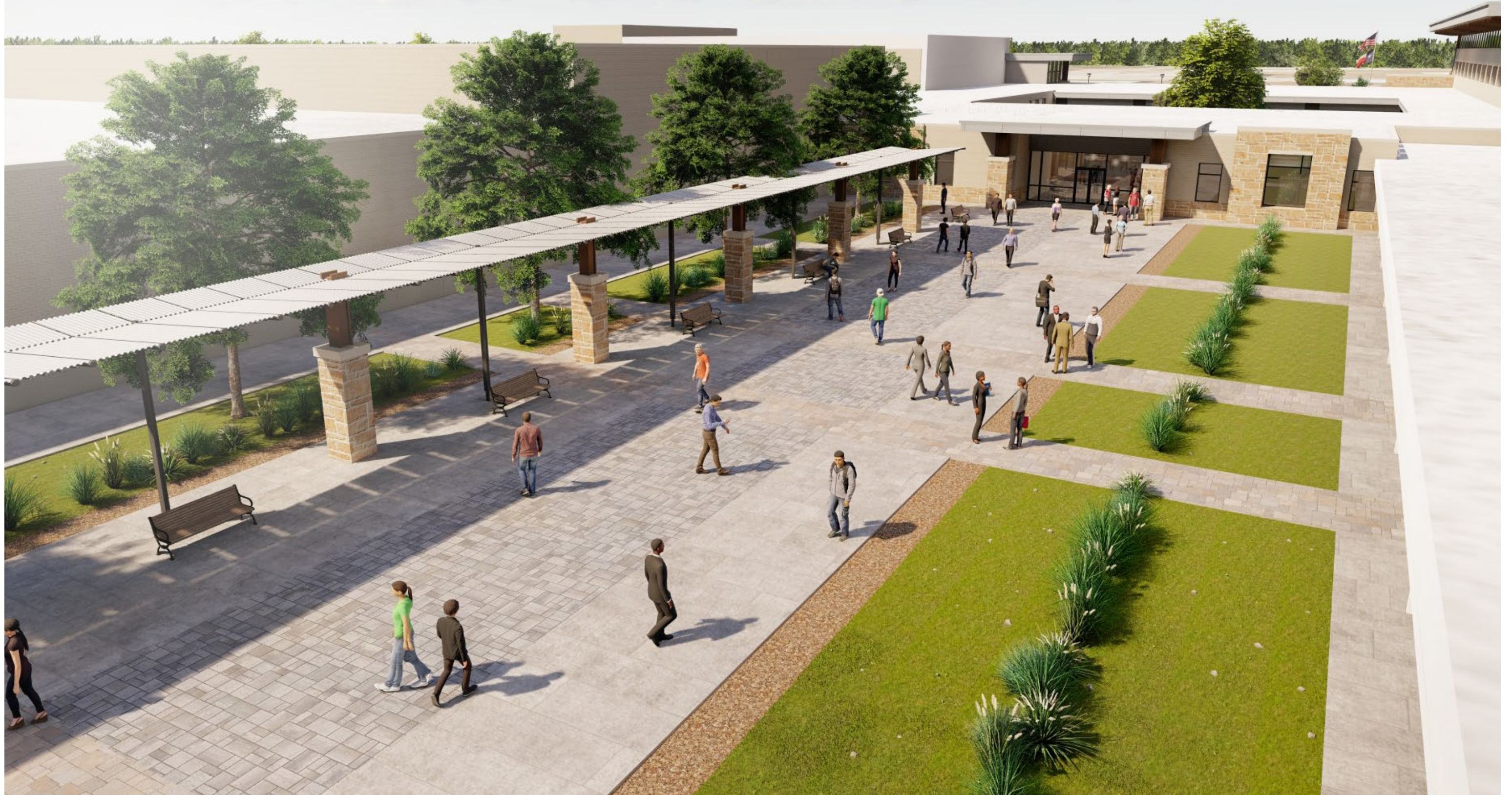
MEDIA CENTER ENTRY - TOP