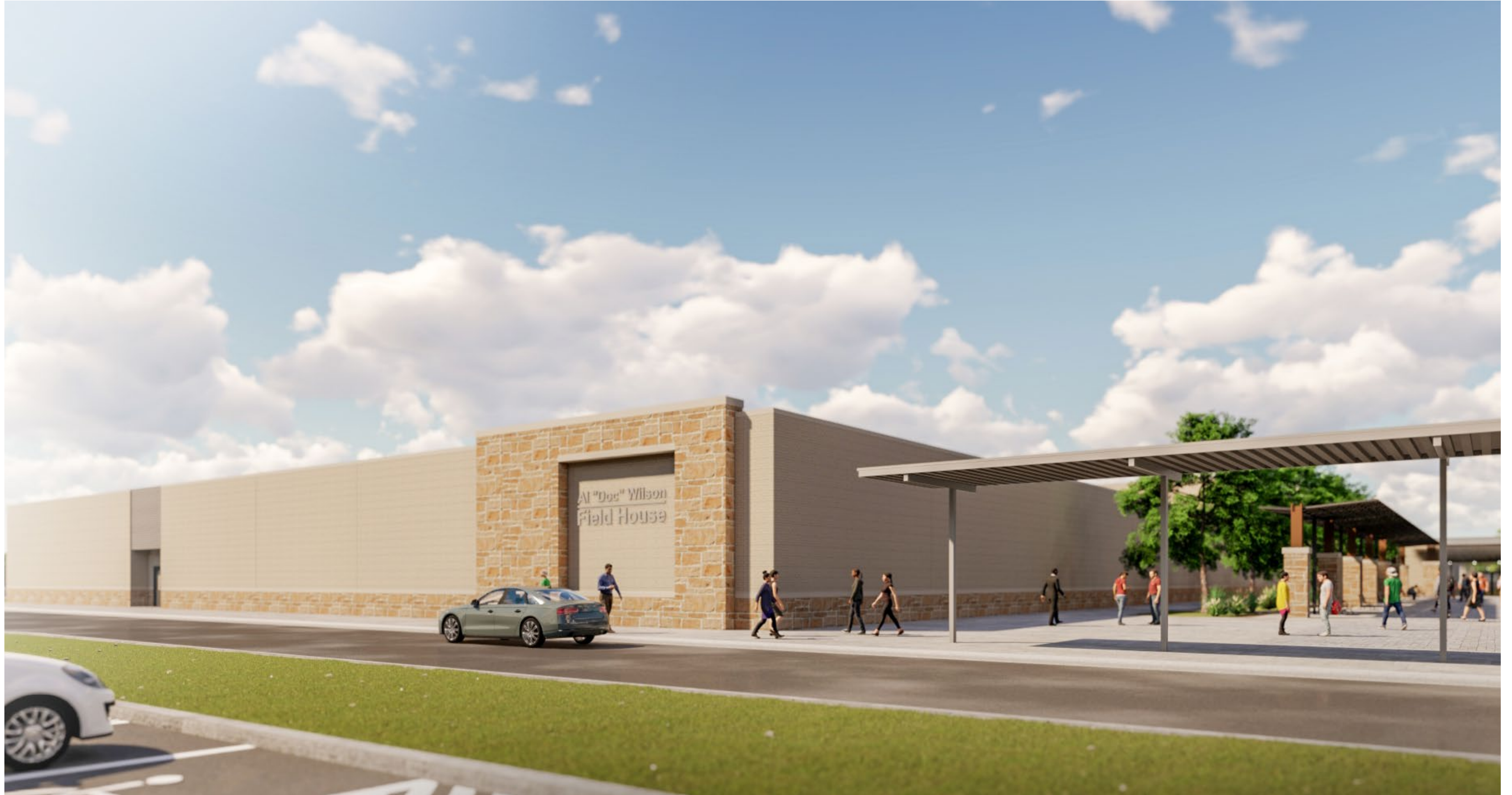
ATHLETICS ENTRY COURTYARD