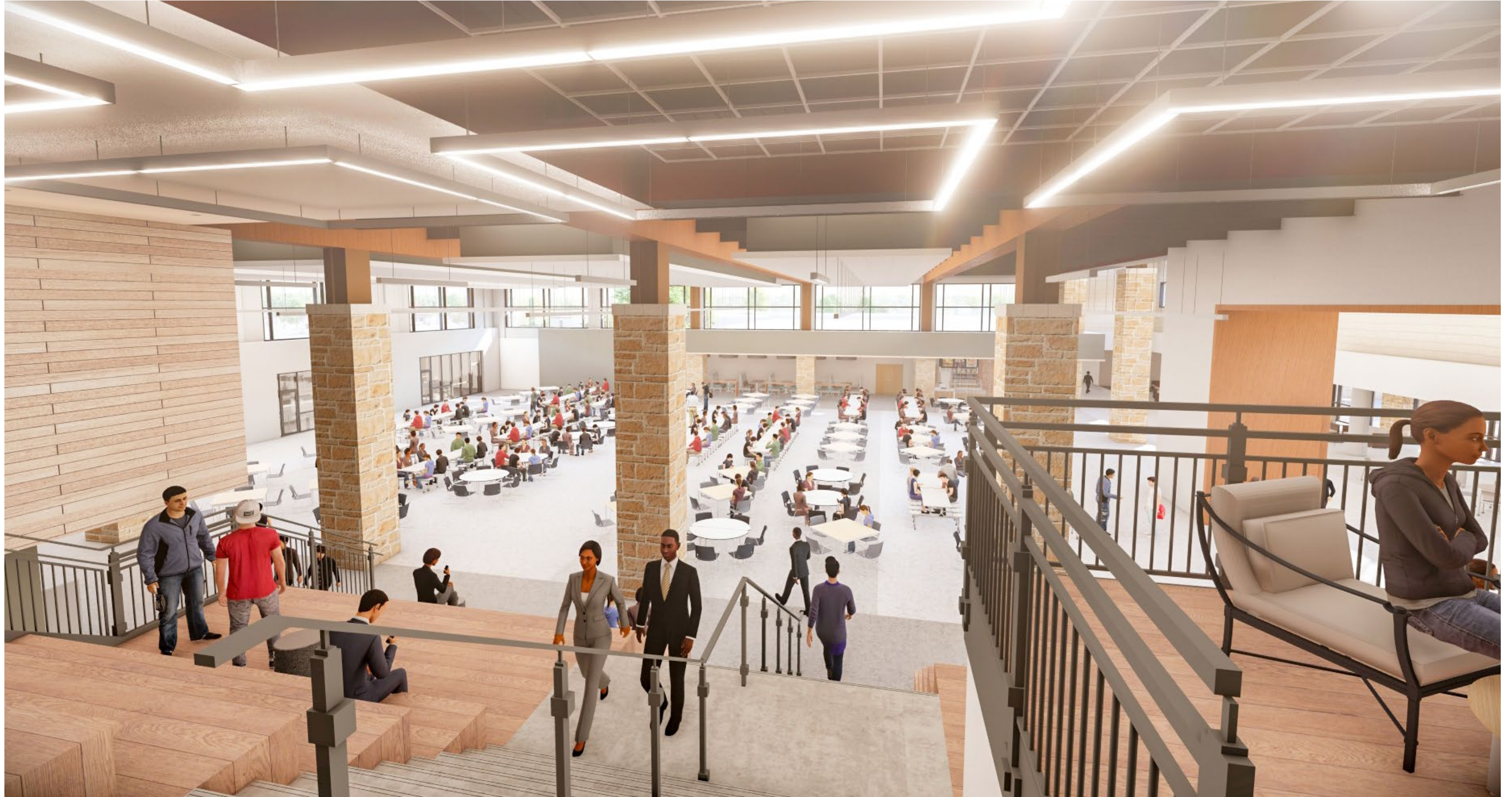
COMMONS AREA FROM LEARNING STAIRS