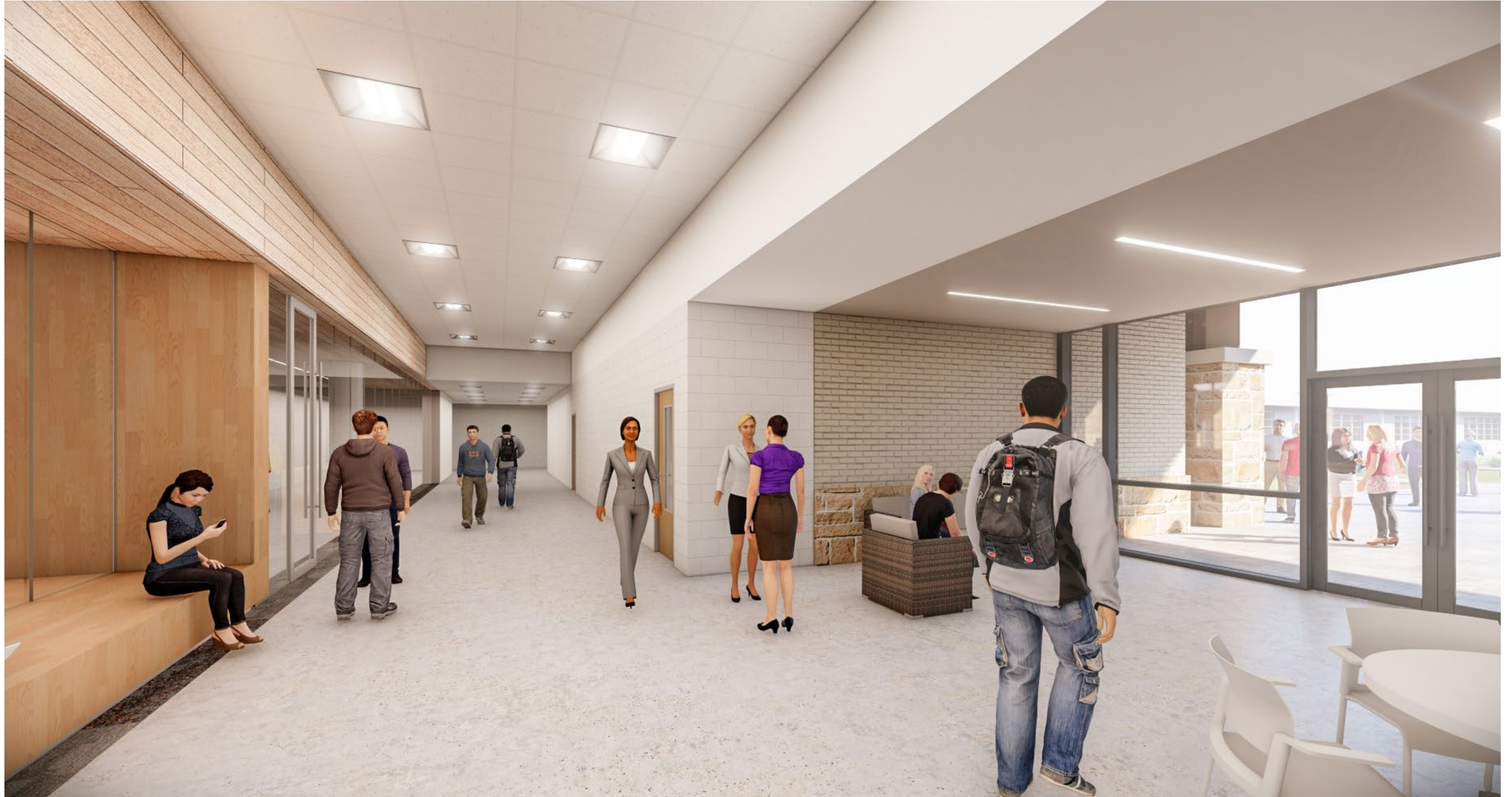
MEDIA CENTER ENTRY SPACE