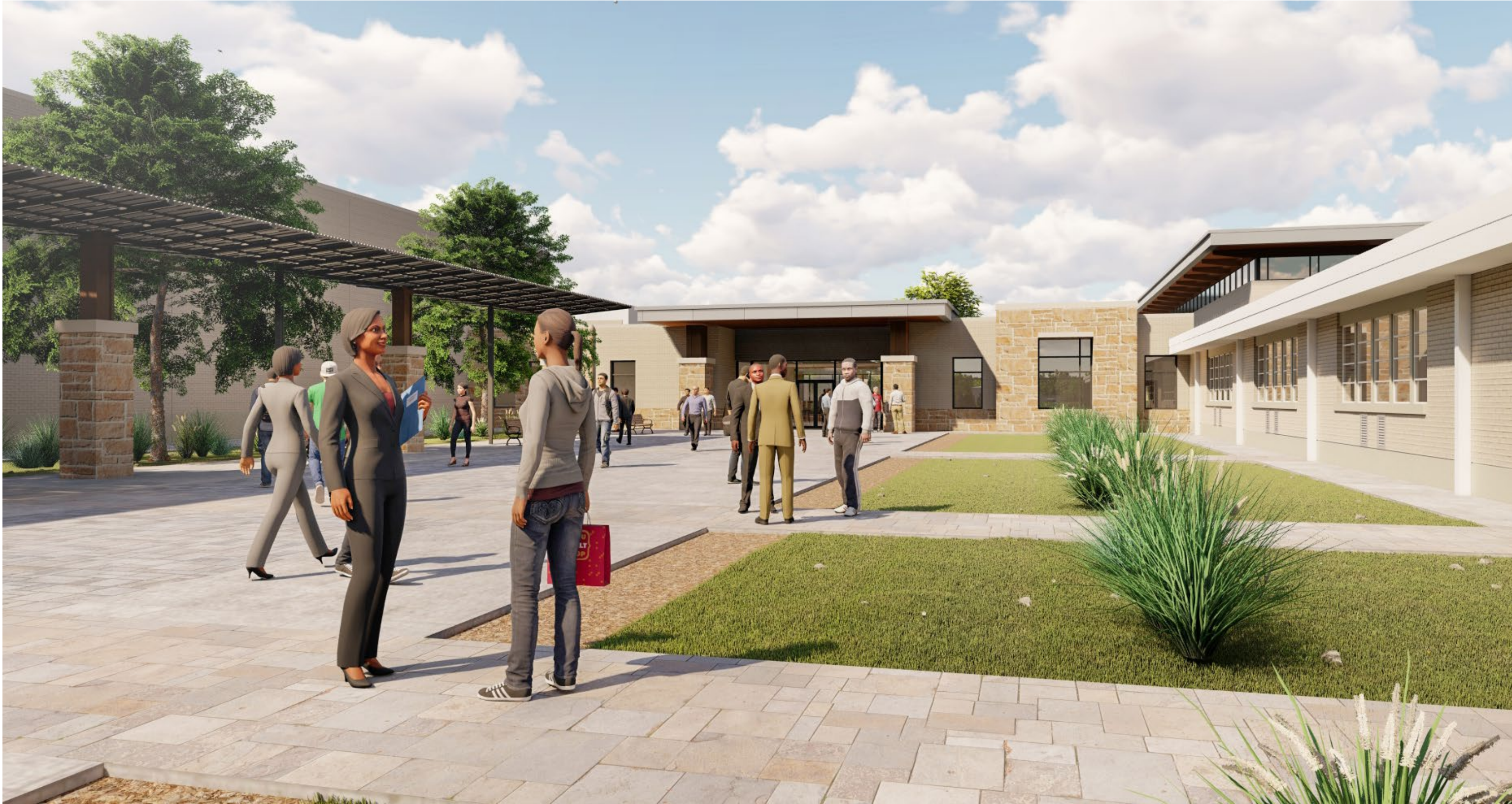
MEDIA CENTER ENTRY