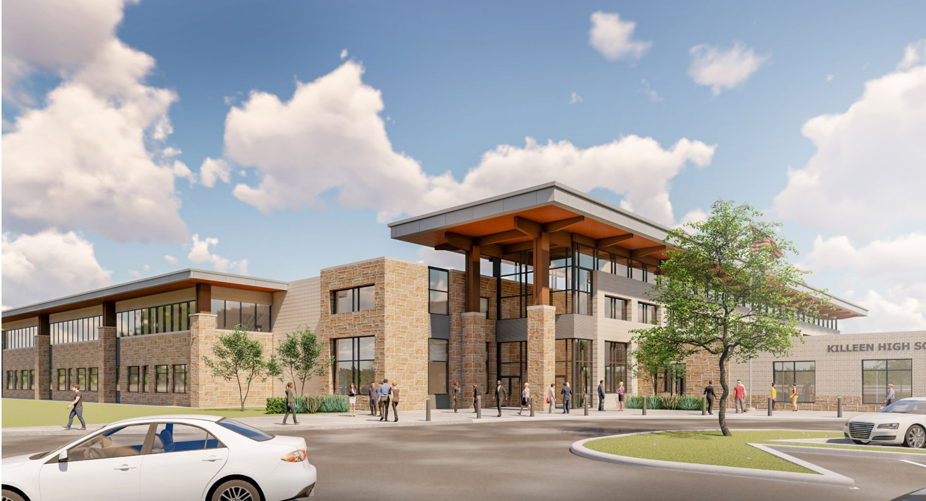
MAIN ENTRY VIEW