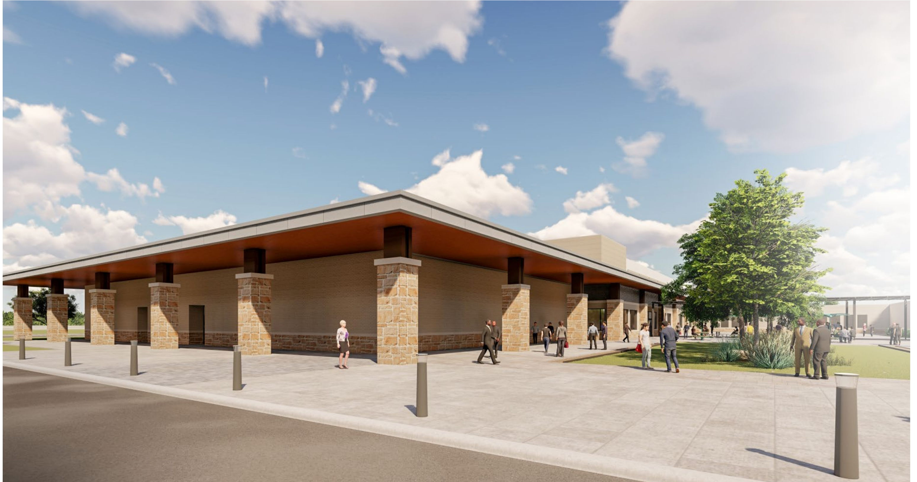
ATHLETICS/ FINE ARTS ENTRY COURTYARD