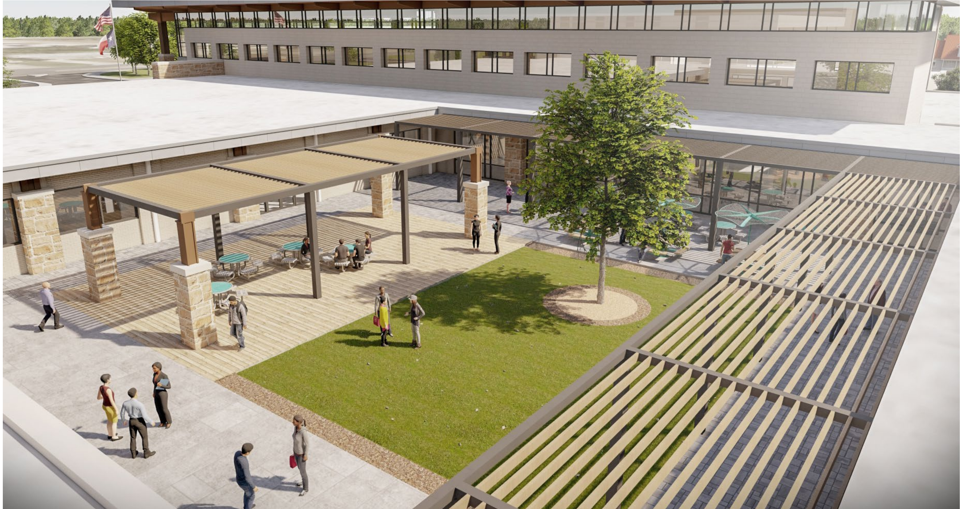
CENTER COURTYARD TOP