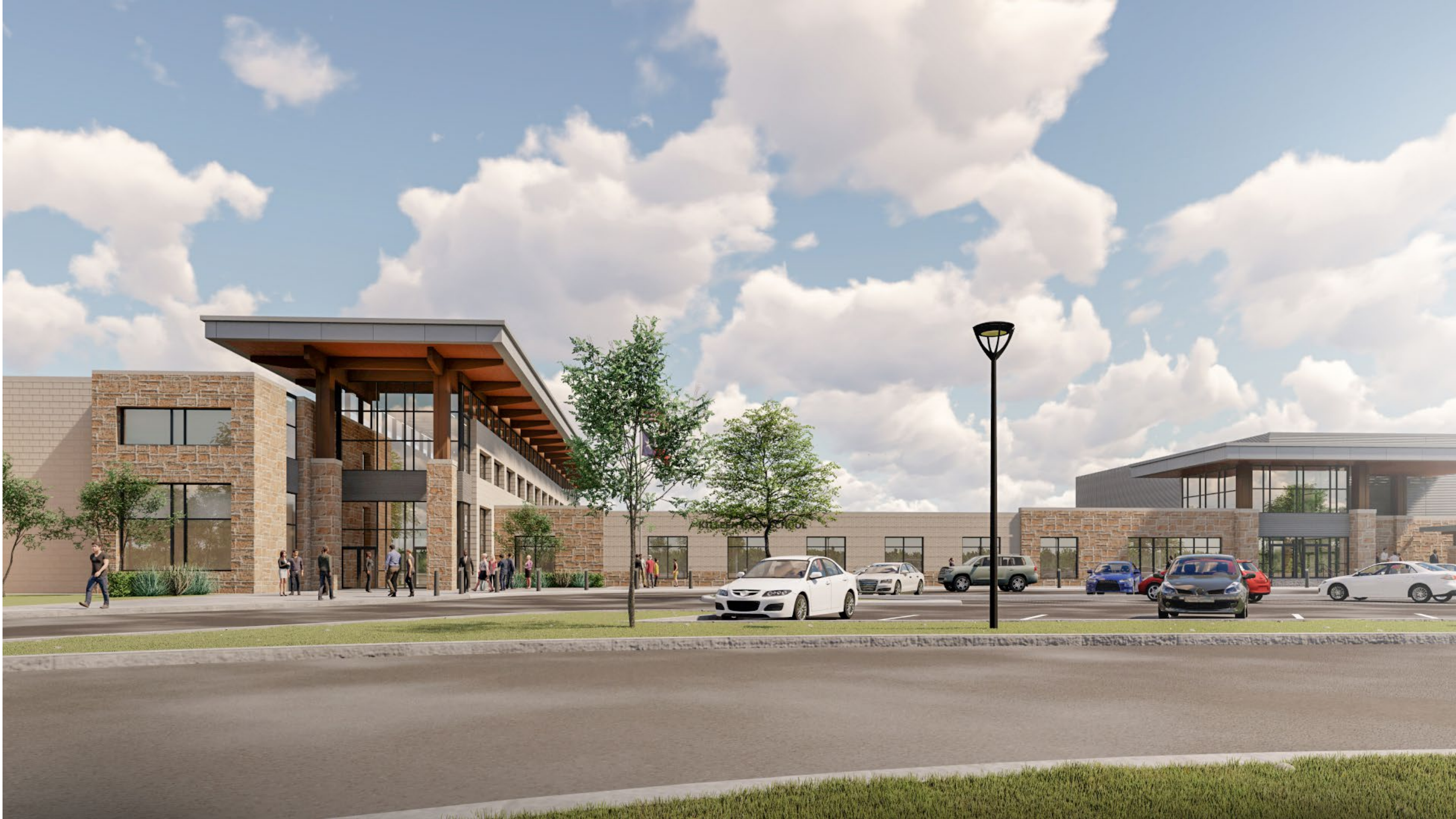
MAIN ENTRY FROM N 38TH ST.