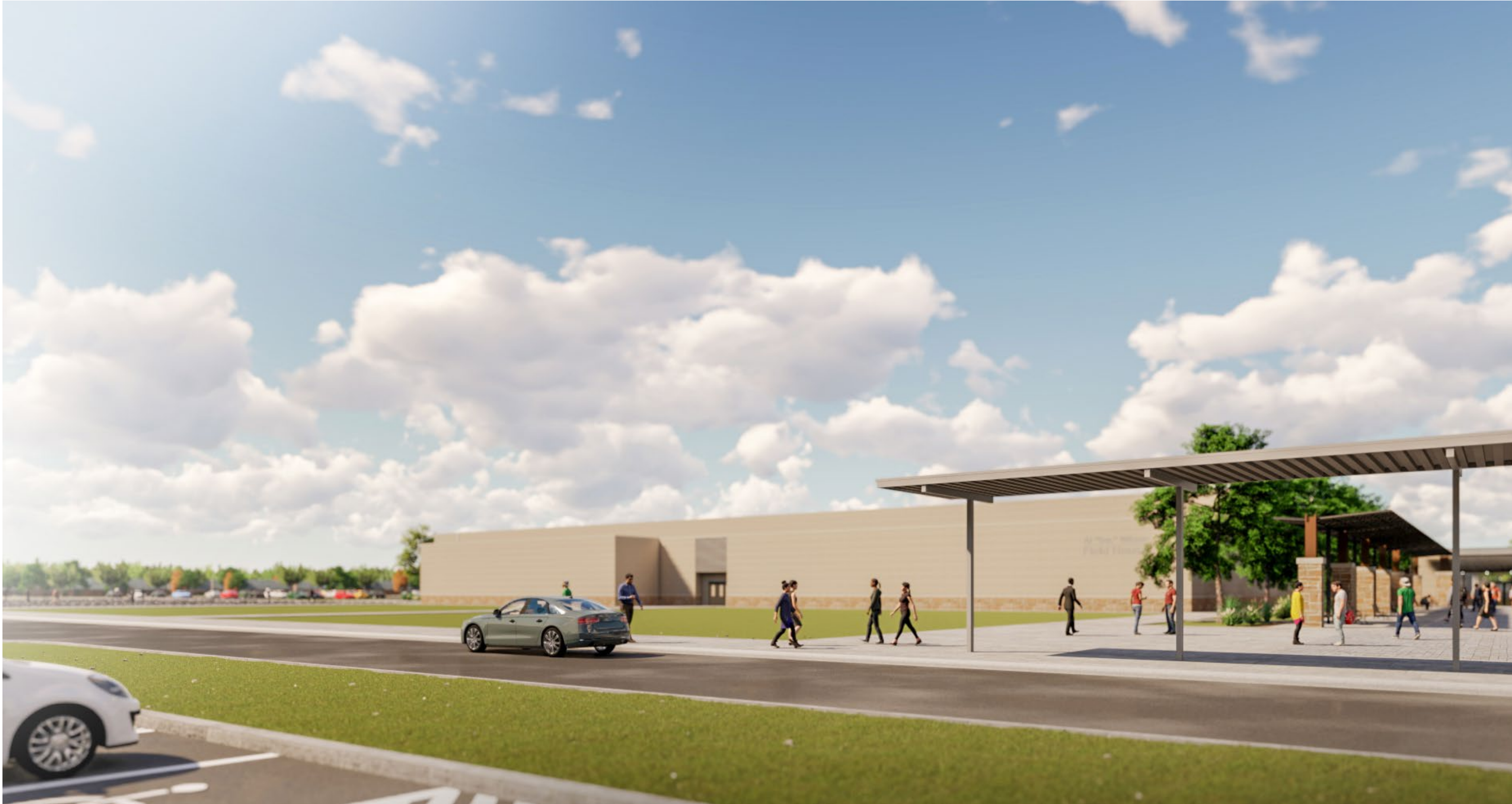
ATHLETICS ENTRY COURTYARD