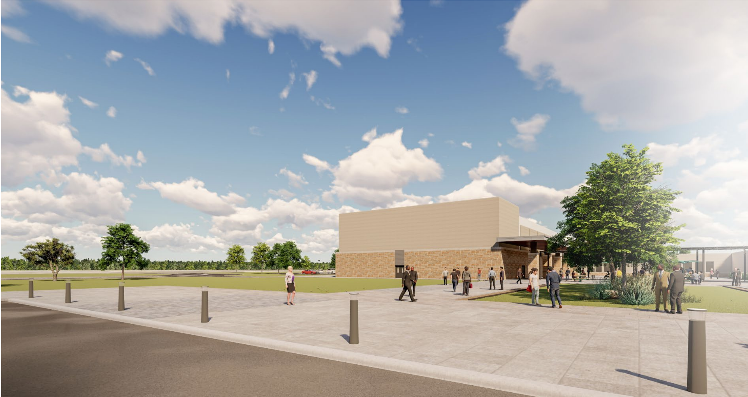
ATHLETICS/ FINE ARTS ENTRY COURTYARD