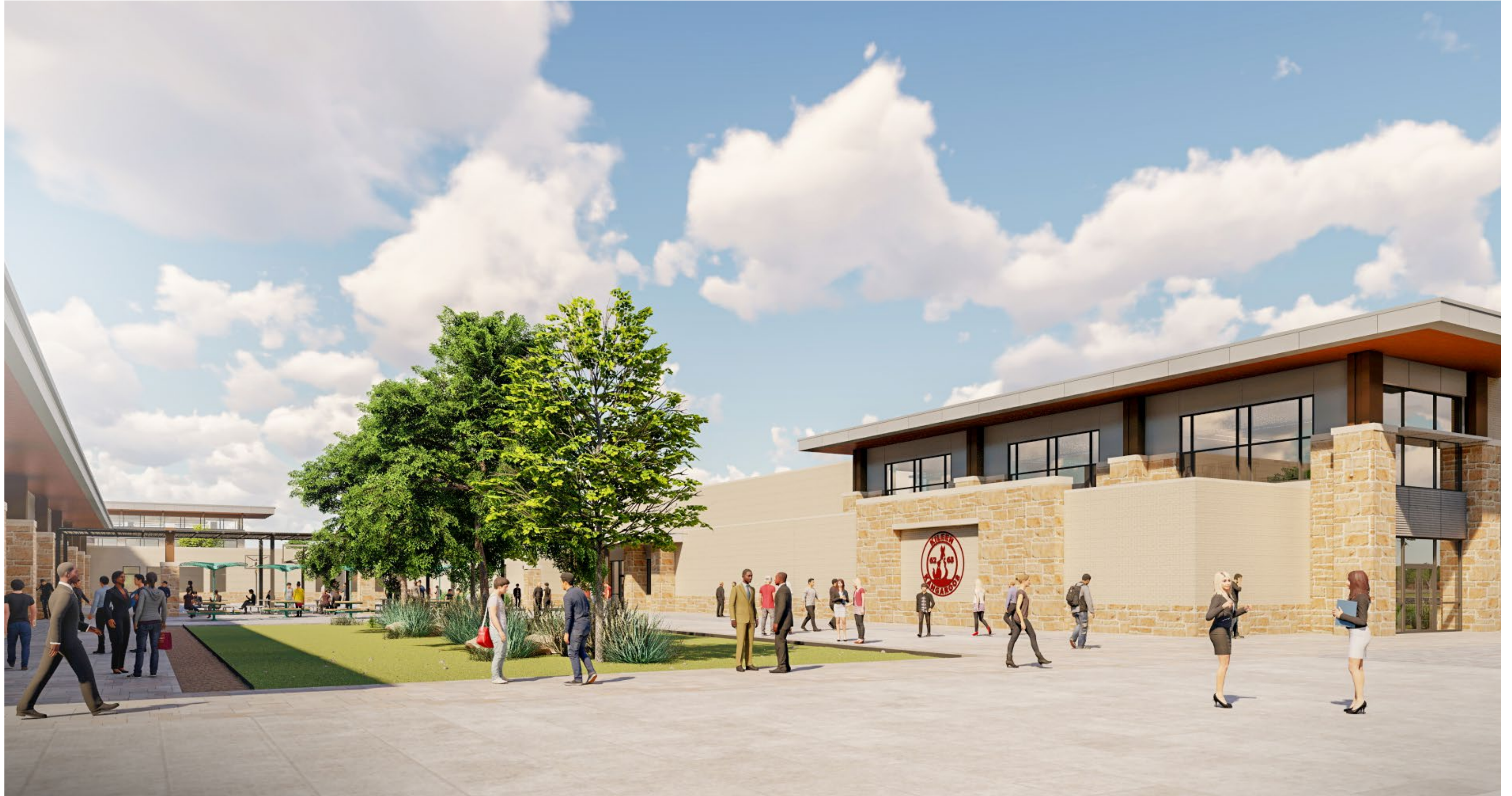
ATHLETICS/ FINE ARTS ENTRY COURTYARD