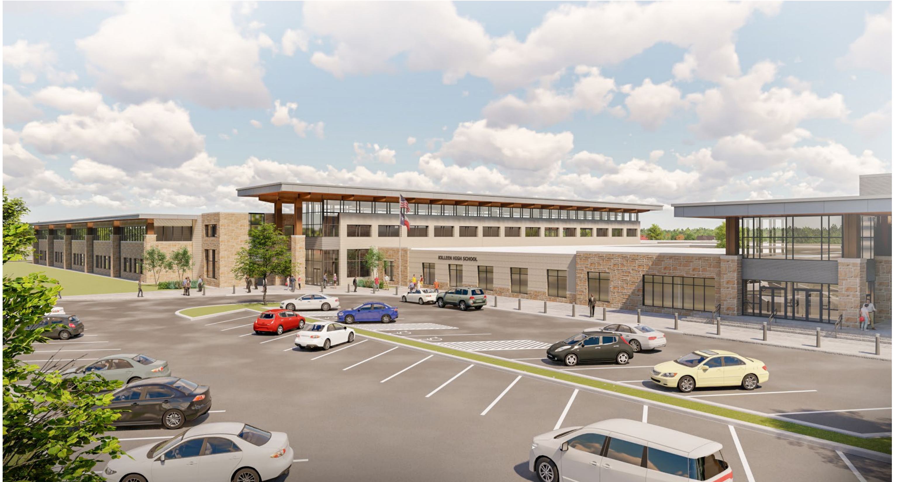
MAIN ENTRY VIEW