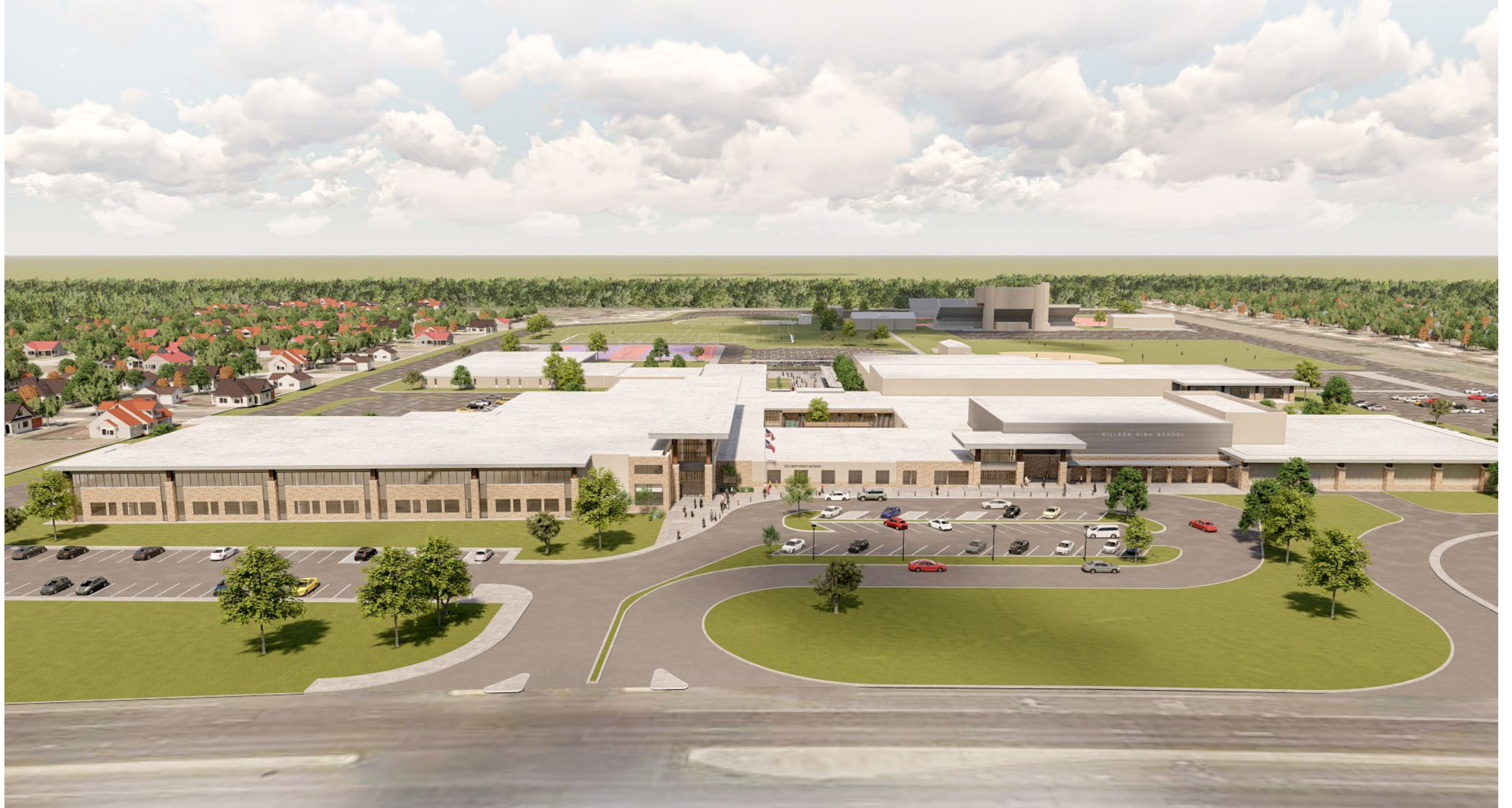
SITE VIEW - LOOKING EAST