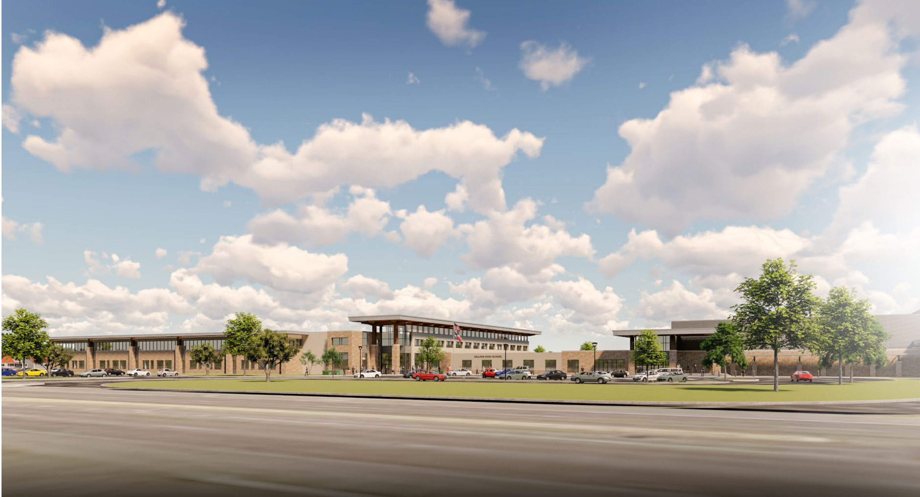
MAIN ENTRY VIEW