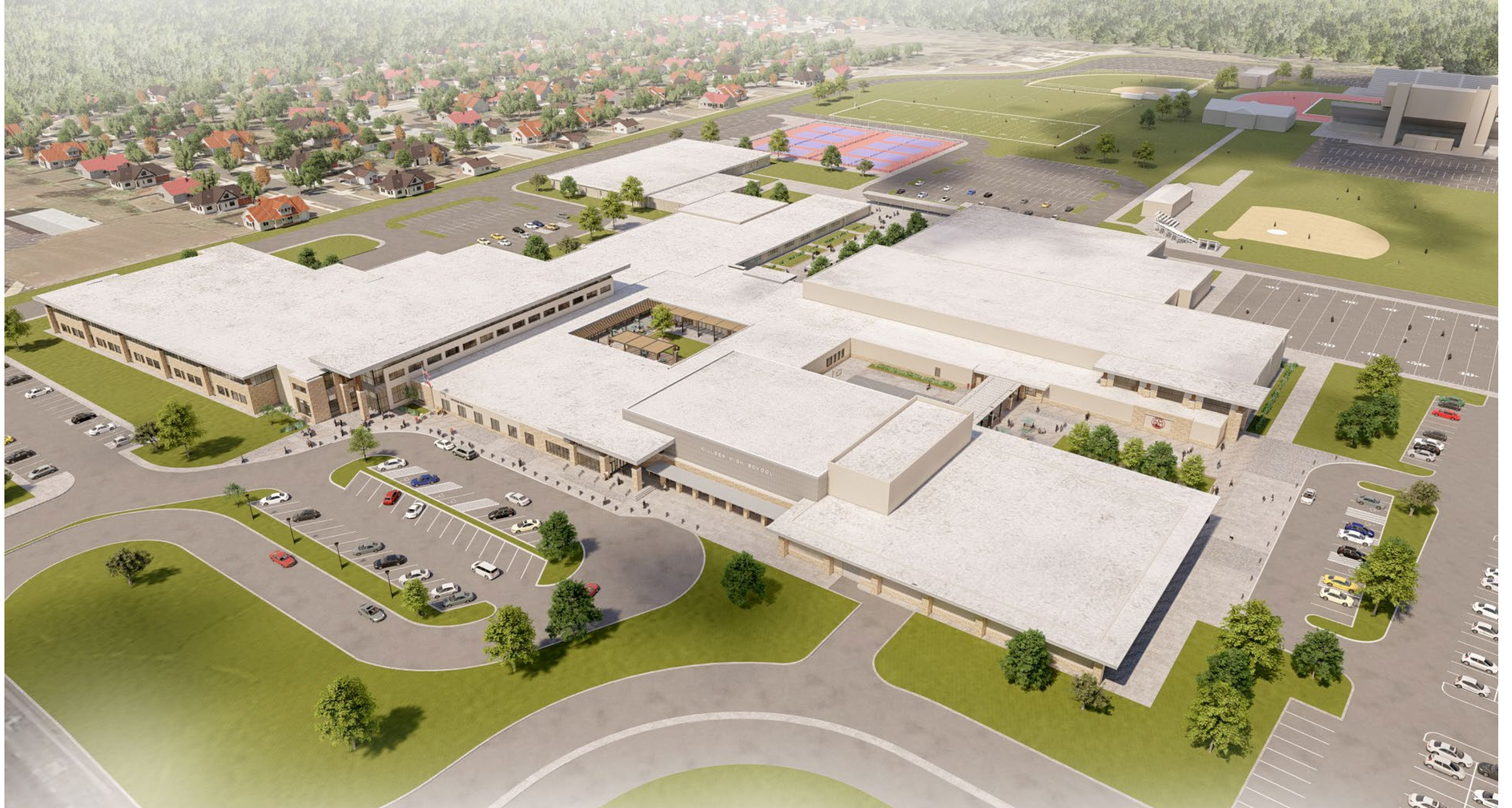
SITE VIEW LOOKING EAST