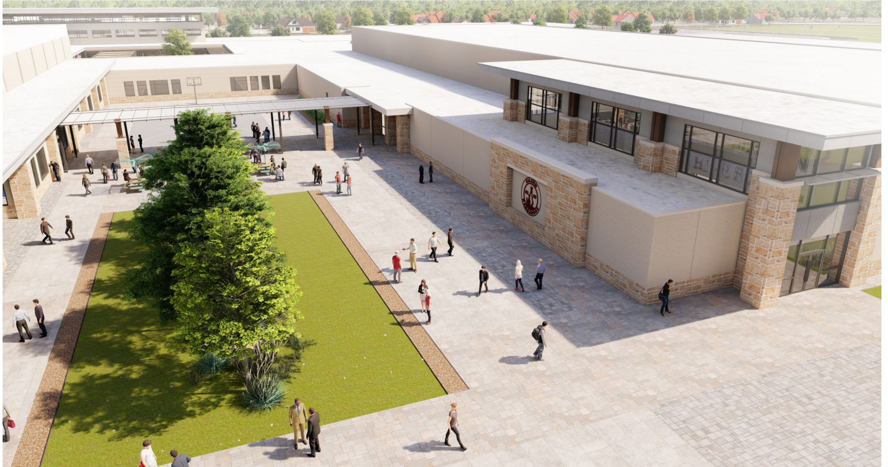
ATHLETICS/ FINE ARTS ENTRY COURTYARD - TOP